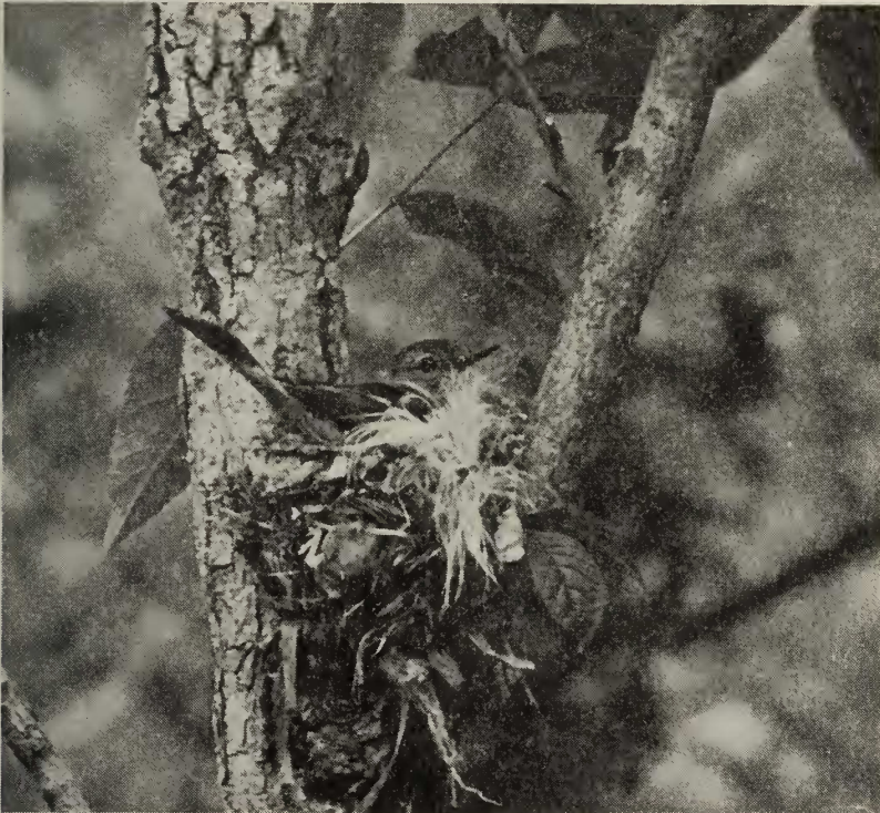
Figure 1. Female Redstart on Nest 4. One nestling has worked its way through the side of the nest and strangled itself.

The last two days of nest life the nestlings make soft noises and flutter their wings when being fed.